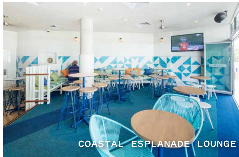
COASTAL ESPLANADE LOUNGE

A preferred supplier list is available. Our Function Team work closely with local vendors to create those niche touches for any occasion.